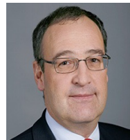
Guy Parmelin Federal Department of Economic Affairs, Education and Research