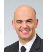
Alain Berset President 2023 Federal Department of Home Affairs