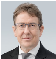
Albert Rösti Federal Department of Transport, Comm- unication and Energy