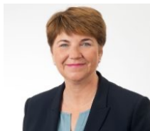
Viola Amherd Federal Department of Defence, Civil Protection and Sport