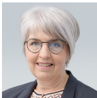
Elisabeth Baume- Schneider Federal Department of Justice and Police