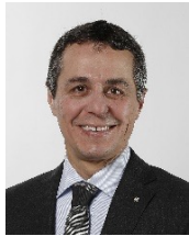
Ignazio Cassis Federal Department of Foreign Affairs