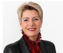
Karin Keller-Sutter Federal Department of Finance