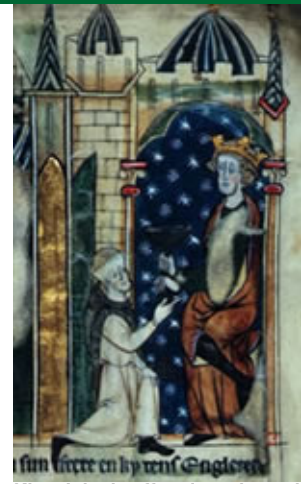
King John is offered a poisoned chalice: Chronicles, c.1280-1300 British Library Cotton MS Vitellius A.xiii, f.5v (detail)

(26) If at the death of a man who holds a lay 'fee' of the Crown, a sheriff or royal official produces royal letters patent of summons for a debt due to the Crown, it shall be lawful for them to seize and list movable goods found in the lay 'fee' of the dead man to the value of